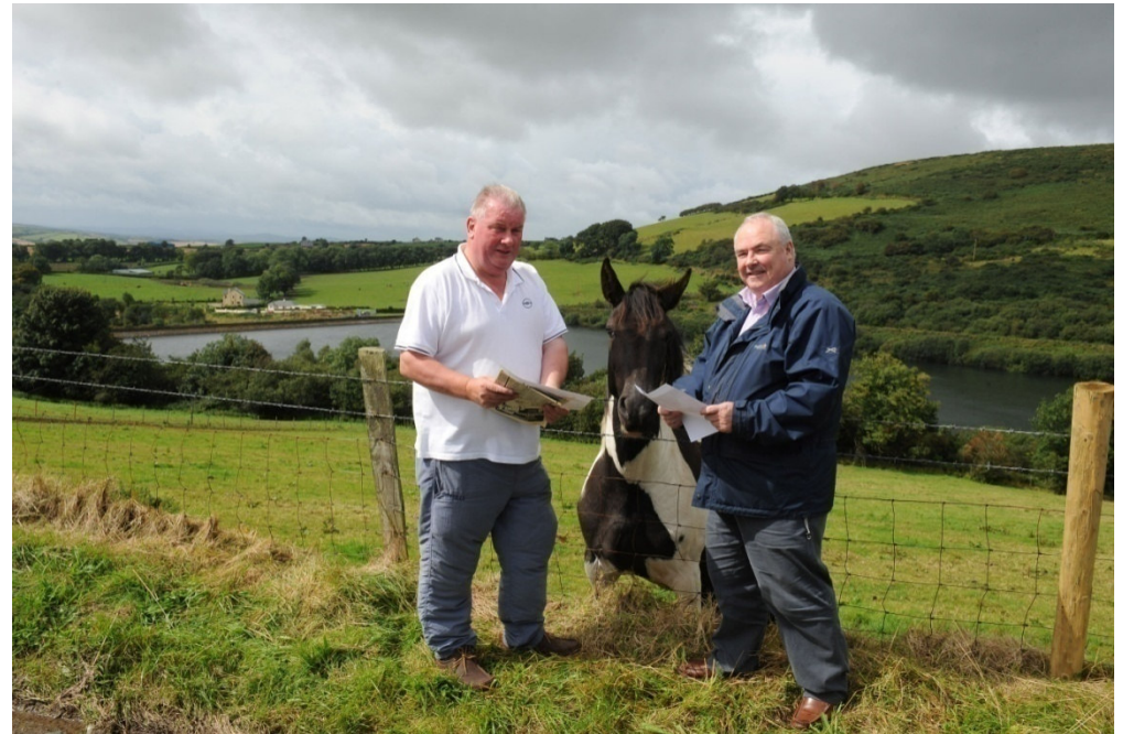
‘GOAL Project’ – put in place by Creggan Neighbourhood in Londonderry to help acknowledge the past and forge new and lasting cross-community links.