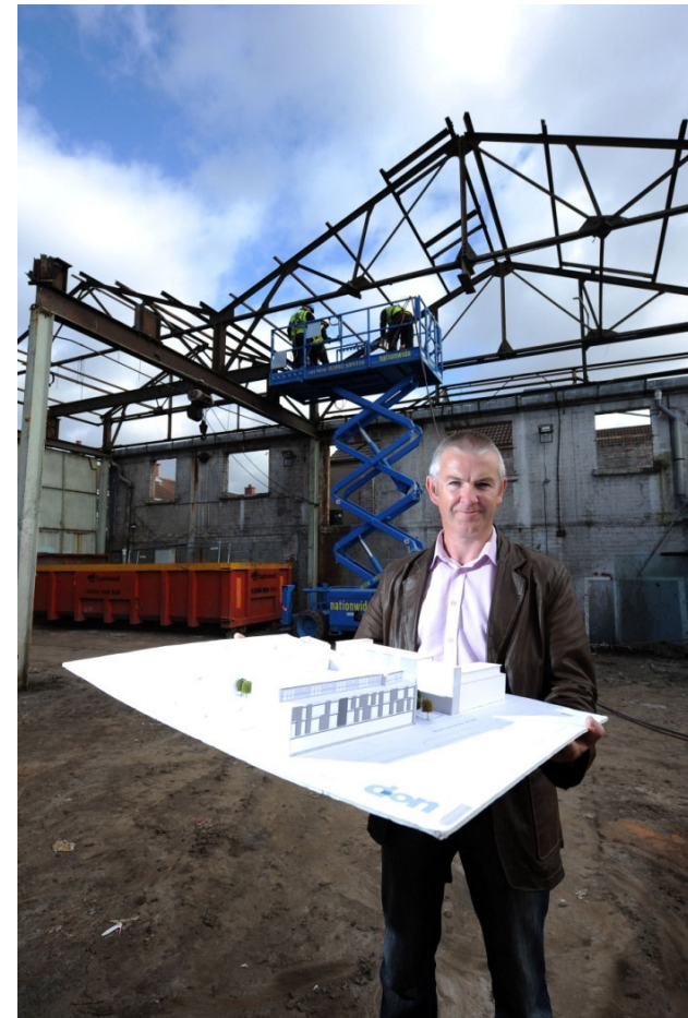
Skainos Project – creation of a new urban village in a neglected inner city area of Belfast.