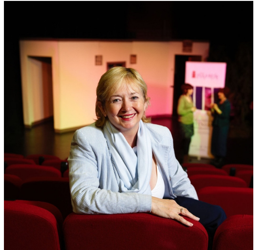
‘Theatre of Witness Project’ – The Playhouse, Londonderry.