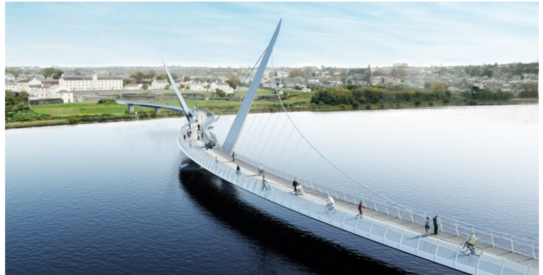
Peace bridge – Londonderry , a new and ‘iconic’ foot and cycle bridge designed to help promote greater cross-community interaction and engagement.